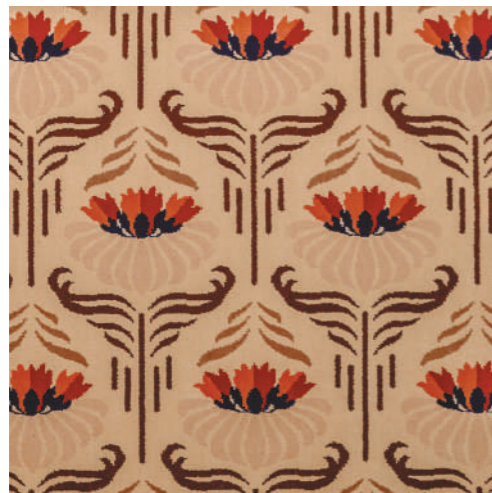
Axminster Technique Custom Design 80% Wool | 20% Nylon 10 mm Thickness 100x100 cm pattern