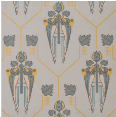
Axminster Technique Custom Design 80% Wool | 20% Nylon 10 mm Thickness 100x100 cm pattern