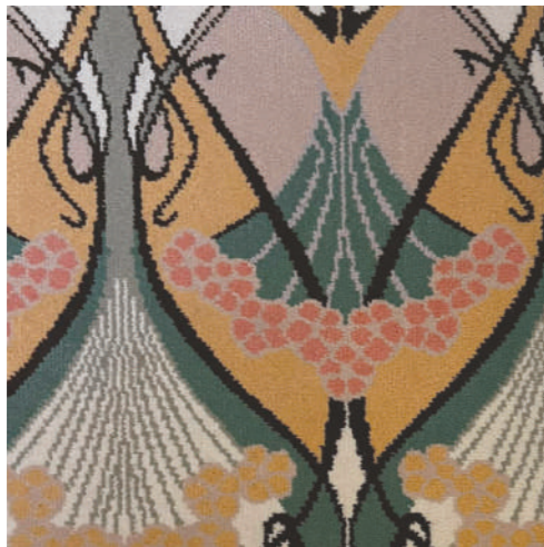
Axminster Technique Custom Design 80% Wool | 20% Nylon 10 mm Thickness 100x100 cm pattern